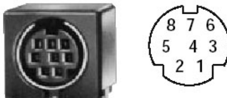
8-Pin Mini-DIN Synch Connector layout

Independent synchronization connectors are located at the rear of the 995068 controller for hardware triggering. The diagram below details the pin out of the Sync connectors: